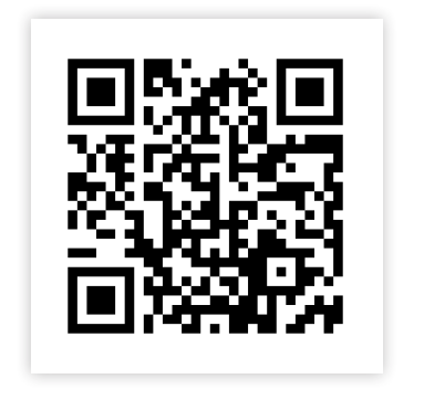
This article is available from: www.archivesofmedicine.com

Conclusions: Prevalence of impaired fasting glucose level/diabetes may have been underestimated because impaired glucose test was not conducted. The prevalence of impaired fasting glucose level/diabetes varied between the two rural districts studied. Impaired fasting glucose level/diabetes was associated with age. Interventions to control diabetes should be district specific and targeted at younger age groups in order to curtail the prevalence of diabetes in older age groups.