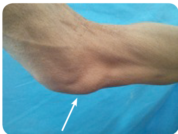
Fig 3. Showing right ulnar nerve thickening with cyst formation.