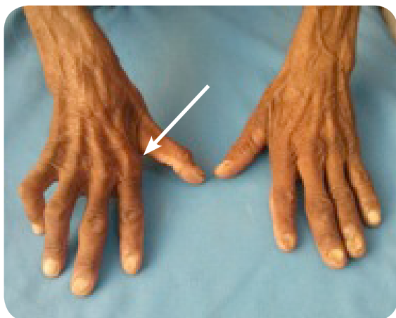
Fig 1. Showing muscle wasting and nail changes of anemia.