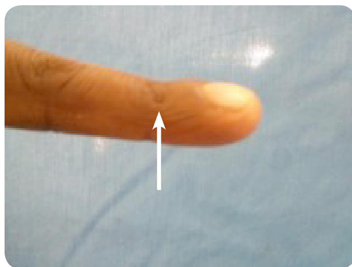
Fig. 1. Showing digital clubbing.

Semen analysis revealed a volume of 3 mL with normal sperm count (45 million) with 70% non motility ( asthenospermia ).