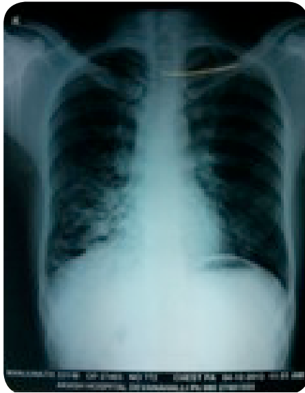
Fig. 3. CXR showing cystic lucencies in right lower zone.